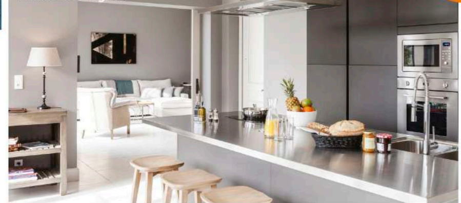
All mod cons in the kitchen of the three-bedroom La Maison des Vignes