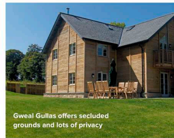
Gweal Gullas offers secluded grounds and lots of privacy

HOW MUCH Treloar (treloar.com; 01326 221224) gets more reasonable the more people go – for example, booking three houses that sleep 15 in total in late September costs £32pp per night. Seven nights at Chybilly costs the equivalent of £32.40pp per night based on 11 staying. Or if you bring 60 people to ten of the estate properties in late September, a week would cost less than £17pp per night. >>